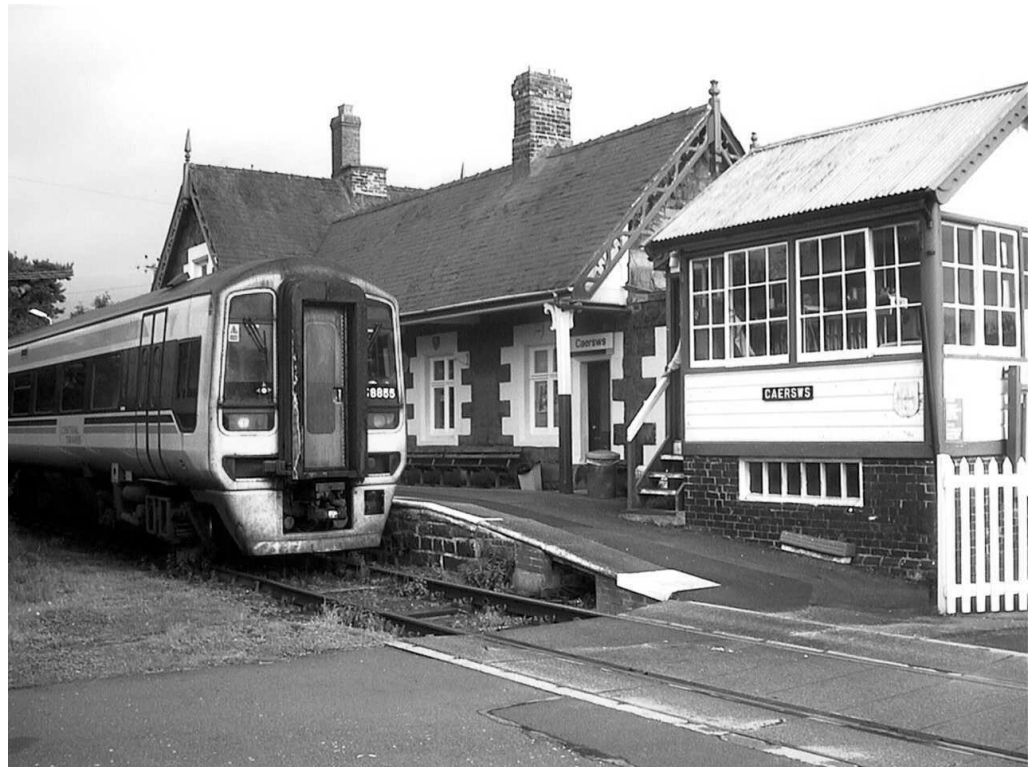
Up train at Caersws.